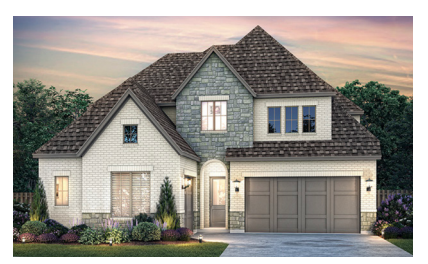
1200 Mandreda Street Available Now

4 Bed | 4.5 Bath | 2 Story $1,042,507 | Sq Ft: 3,534