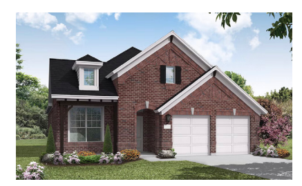
4291 Berylline Lane Coming Soon

4 Bed | 4 Bath | 2 Story $820,485 | Sq Ft: 3,225