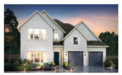
4160 Rosita Lane Available June 2025

5 Bed | 5 Bath | 2 Story $1,209,000 | Sq Ft: 4,164