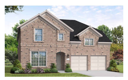
4311 Berylline Lane Coming Soon