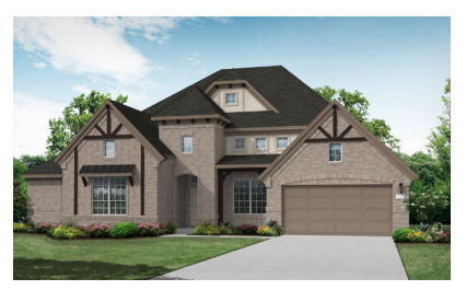
4040 Lavinia Lane Coming Soon

4 Bed | 3 Bath | 1 Story $1,081,293 | Sq Ft: 3,190