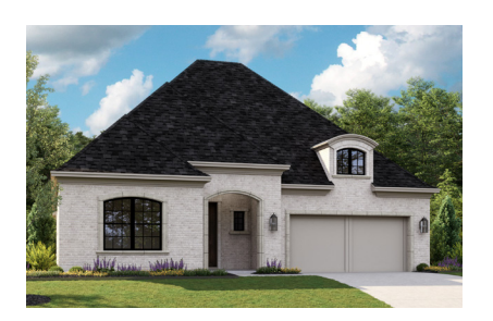
4740 Belo Drive Available Summer 2025

4 Bed | 4.5 Bath | 2 Story $1,009,900 | Sq Ft: 3,634