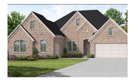
4050 Lavina Lane Coming Soon

4230 Old Rosebud Lane, Prosper, Texas, 75078 4000 Zina Lane, Prosper, Texas, 75078