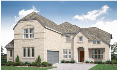
4111 Lavina Lane Available Jan 2025

5 Bed | 4 Bath | 2 Story $899,990 | Sq Ft: 3,480