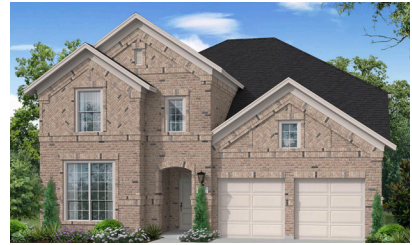
4271 Berylline Lane Available Feb 2025

4 Bed | 4 Bath | 2 Story $802,032 | Sq Ft: 3,018