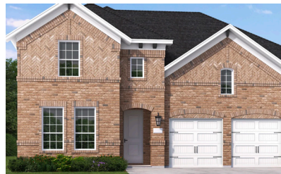
4311 Berylline Lane Available Feb 2025

4 Bed | 4 Bath | 2 Story $852,428 | Sq Ft: 3,307