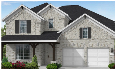
4301 Berylline Lane Available March 2025

4 Bed | 4 Bath | 2 Story $834,461 | Sq Ft: 3,509