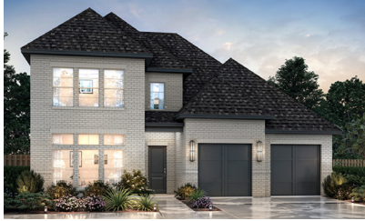
1150 Raffel Road Available March 2025

4 Bed | 4.5 Bath | 2 Story $1,038,210 | Sq Ft: 3,757