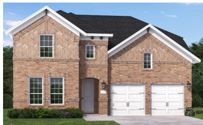
4311 Berylline Lane Available Feb 2025

4 Bed | 4 Bath | 2 Story $804,255 | Sq Ft: 3,028