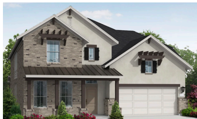
4291 Berylline Lane Available Feb 2025

4 Bed | 4 Bath | 2 Story $853,078 | Sq Ft: 3,290