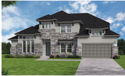
941 Verdin Street Available Nov 2024

5 Bed | 4.5 Bath | 2 Story $1,049,990 | Sq Ft: 4,055