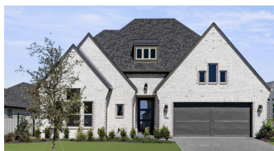
4750 Muleshoe Lane

4210 Old Rosebud Lane, Prosper, TX 75078