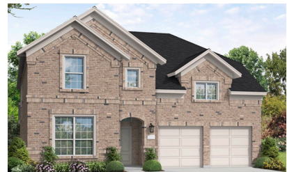
4281 Berylline Lane Available Feb 2025

4 Bed | 4 Bath | 2 Story $840,565 | Sq Ft: 3,311