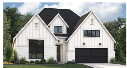
4790 Muleshoe Lane