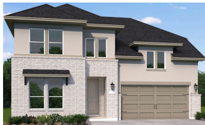
4251 Berylline Lane Available Feb 2025

4 Bed | 4.5 Bath | 2 Story $845,485 | Sq Ft: 3,464