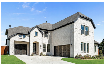
4350 Berylline Lane

4250 Old Rosebud Lane, Prosper, Texas, 75078