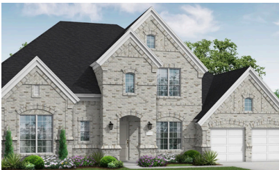
4000 Lavina Lane Available March 2025

4 Bed | 4 Bath | 2 Story $834,461 | Sq Ft: 3,509