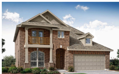
4130 Mill Pond Drive