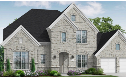
4040 Toliver Drive Coming Soon

5 Bed | 4.5 Bath | 2 Story $1,195,418 | Sq Ft: 4,330