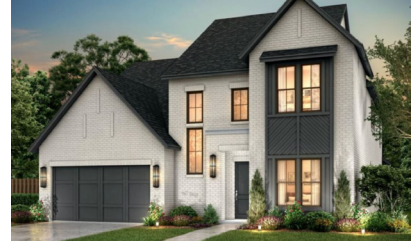
4111 Holland Court Available March 2025

4 Bed | 4.5 Bath | 2 Story $1,039,161 | Sq Ft: 3,494