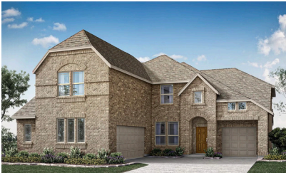
950 Nance Lane Available Dec 2024

5 Bed | 4 Bath | 2 Story $799,990 | Sq Ft: 2,849