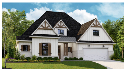
300 Telico Court