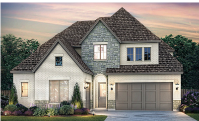
1200 Mandreda Street Available March 2025

5 Bed | 5 Bath | 2 Story $1,228,458 | Sq Ft: 4,164