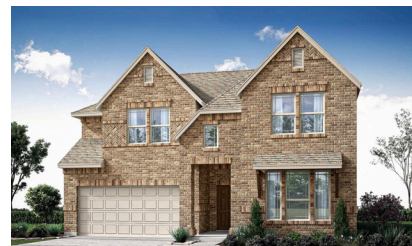
4361 Berylline Lane