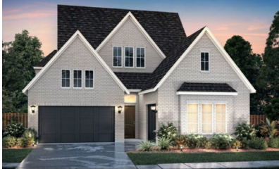
1200 Chickadee Street Available March 2025

4 Bed | 4.5 Bath | 2 Story $1,038,210 | Sq Ft: 3,757