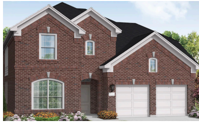
4321 Berylline Lane Available Feb 2025

5 Bed | 4.5 Bath | 2 Story $1,049,990 | Sq Ft: 4,055