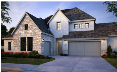
4750 Stillwell Court Available March 2025

5 Bed | 5.5 Bath | 2 Story $1,116,543 | Sq Ft: 3,799