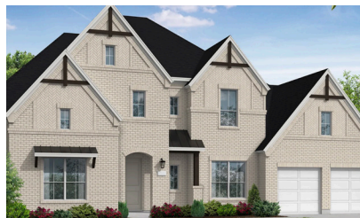
990 Verdin Street Available Now 5 Bed | 4.5 Bath | 2 Story $1,149,990 | Sq Ft: 4,464

4230 Old Rosebud Lane, Prosper, Texas, 75078