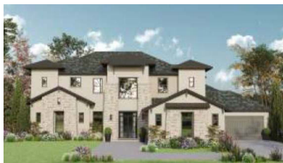
381 Zambrano Drive