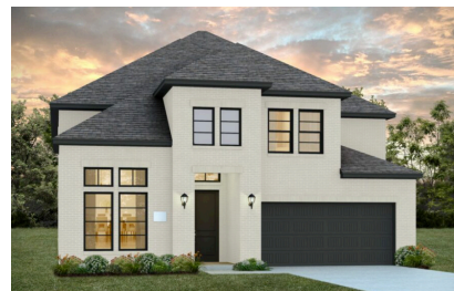
4230 Avocet Lane Available Oct 2024 5 Bed | 5 Bath | 2 Story $805,323 | Sq Ft: 3,427