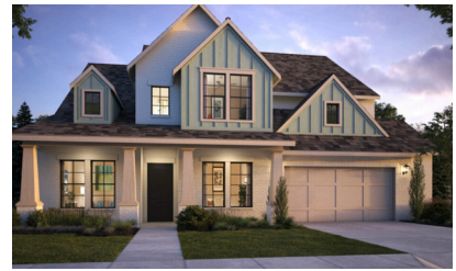
4730 Stillwell Court Available April 2025

5 Bed | 5.5 Bath | 2 Story $1,250,268 | Sq Ft: 4,392