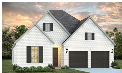
4220 Kestrel Street Available Oct 2024

4 Bed | 4 Bath | 2 Story $716,641 | Sq Ft: 2,869