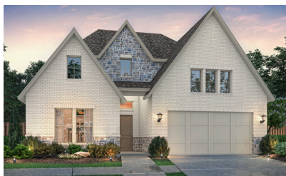
4631 Durst Lane Available April 2025

5 Bed | 5 Bath | 2 Story $1,228,458 | Sq Ft: 4,164