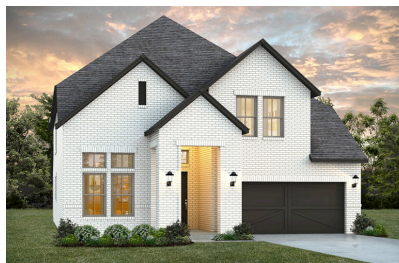
4150 Holland Court Available Oct 2024 5 Bed | 5.5 Bath | 2 Story $842,941 | Sq Ft: 3,593