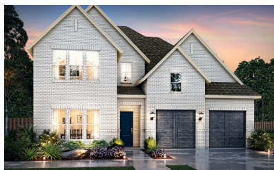
1120 Manfreda Street Available Dec 2024 4 Bed | 4.5 Bath | 2 Story $1,004,244 | Sq Ft: 3,757