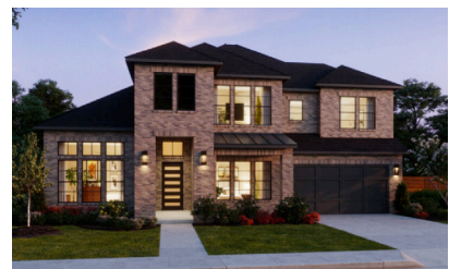
1120 Monarch Street Available Dec 2024 5 Bed | 5.5 Bath | 2 Story $1,368,998 | Sq Ft: 4,500