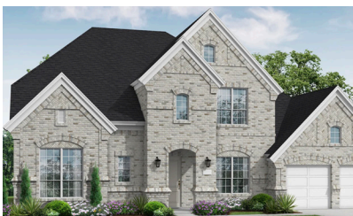
4040 Toliver Drive Available Oct 2024

4 Bed | 3 Bath | 1 Story $731,199 | Sq Ft: 2,541