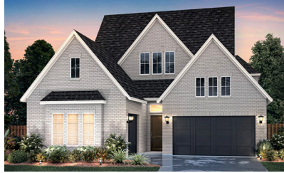
4600 Mayfield Drive Available Feb 2025

4 Bed | 4.5 Bath | 2 Story $995,540 | Sq Ft: 3,534