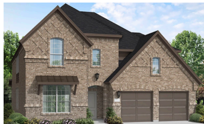
4261 Berylline Lane Coming Soon

5 Bed | 4.5 Bath | 2 Story $1,195,418 | Sq Ft: 4,330