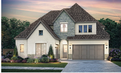
4460 Durst Lane Available Feb 2025

4 Bed | 4.5 Bath | 2 Story $995,540 | Sq Ft: 3,534