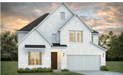
4140 Holland Court Available Nov 2024

4 Bed | 4 Bath | 2 Story $716,641 | Sq Ft: 2,869