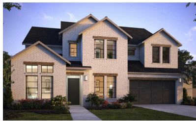
4770 Stillwell Court Available April 2025

5 Bed | 5.5 Bath | 2 Story $1,198,363 | Sq Ft: 4,053