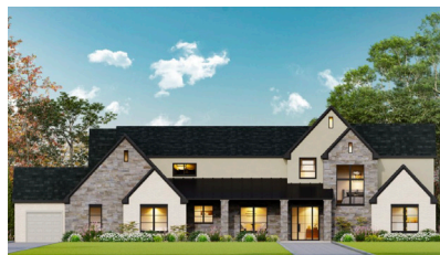
381 Belo Drive