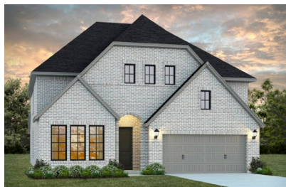
4220 Holland Court Available Sept 2024 4 Bed | 4.5 Bath | 2 Story $793,093 | Sq Ft: 3,355