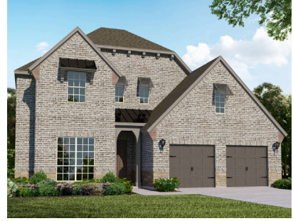
810 Old Alton Drive Available Nov 2023

5 Bed | 5 Bath | 2 Story $1,196,375 | Sq Ft: 4,144