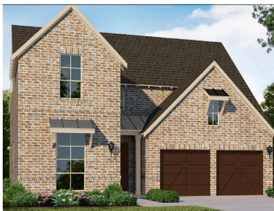
3890 Dixie Drive Available Jan 2024

4 Bed | 4.5 Bath | 2 Story $1,026,225 | Sq Ft: 3,702