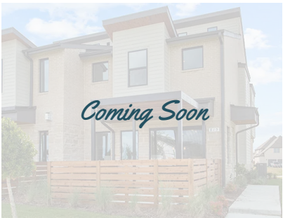
880 Dulaney Court Available Oct 2023

3 Bed | 2.5 Bath | 2 Story $505,487 | Sq Ft: 1,886