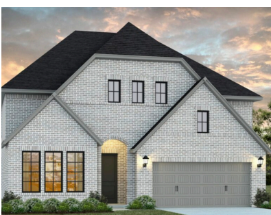
1270 Manfreda Street Available Nov 2023 4 Bed | 4.5 Bath | 2 Story $830,871 | Sq Ft: 3,355