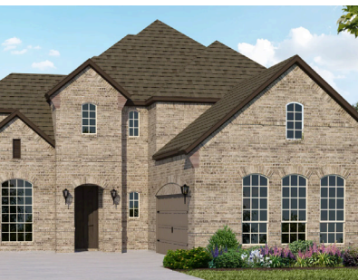
4371 Sandhills Lane Available Jan 2024

4 Bed | 4.5 Bath | 2 Story $891,160 | Sq Ft: 3,499