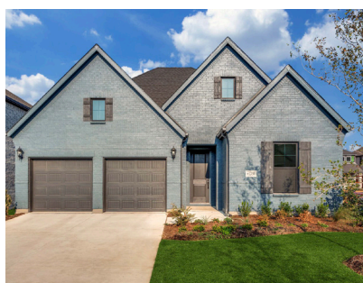
1231 Crescent Lane Available Sept 2023 4 Bed | 4 Bath | 2 Story $731,215 | Sq Ft: 2,869