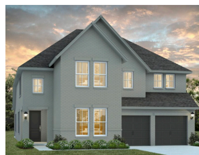
1260 Manfreda Street Available Dec 2023 5 Bed | 4 Bath | 2 Story $833,448 | Sq Ft: 3,598