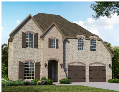
4391 Sandhills Lane Available Dec 2023

4 Bed | 4.5 Bath | 2 Story $978,275 | Sq Ft: 3,704