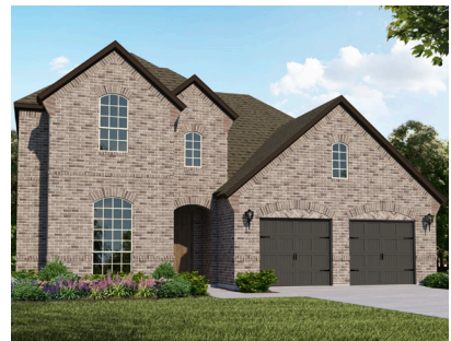
830 May Banks Avenue Available Dec 2023

5 Bed | 4.5 Bath | 2 Story $833,365 | Sq Ft: 3,468