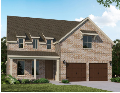
921 Webb Lane Available Oct 2023

5 Bed | 4 Bath | 2 Story $930,535 | Sq Ft: 3,468