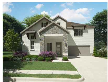
4261 Avocet Lane