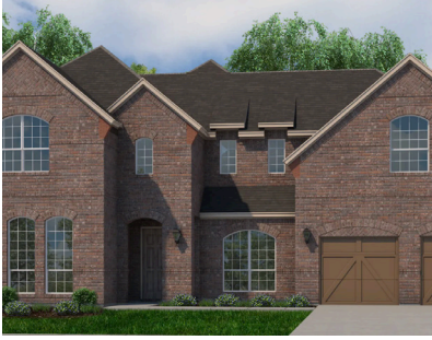
4720 Lopiano Street Available Oct 2023

5 Bed | 4 Bath | 2 Story $930,535 | Sq Ft: 3,468