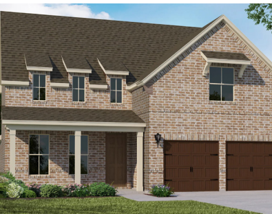
1060 Adair Road Available Dec 2023

4 Bed | 4.5 Bath | 2 Story $1,046,005 | Sq Ft: 3,704