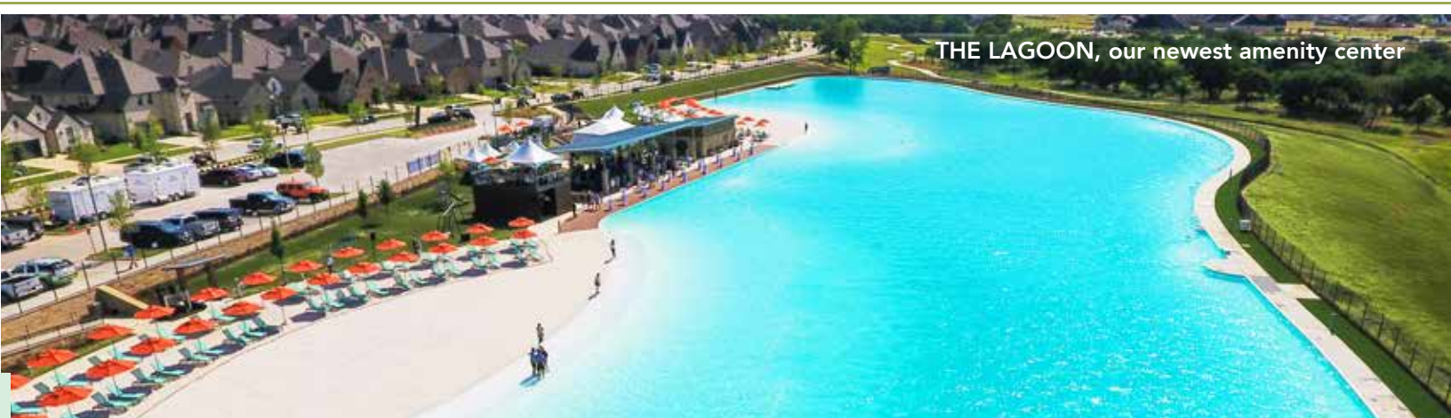
THE LAGOON, our newest amenity center