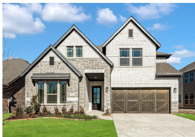
4120 Berylline Lane Available Now 4 Bed | 3 Bath | 2 Story $709,990 | Sq Ft: 2,595

4250 Old Rosebud Lane, Prosper, Texas, 75078