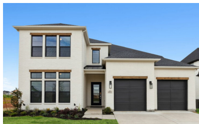
4231 Kinglet Court Available Now 4 Bed | 4.5 Bath | 2 Story $930,729 | Sq Ft: 3,757