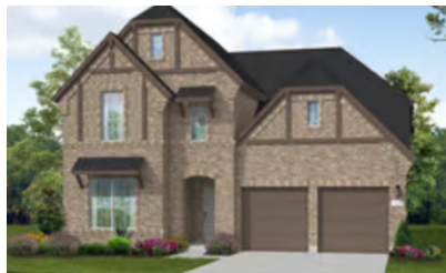
4201 Gambel Road Available June 2024

4230 Old Rosebud Lane, Prosper, Texas, 75078