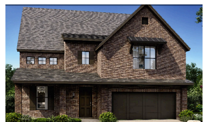
931 Webb Lane Available Aug 2024

4 Bed | 4 Bath | 2 Story $869,000 | Sq Ft: 3,590