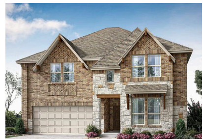
4190 Berylline Lane Available Now 5 Bed | 4 Bath | 2 Story $779,990 | Sq Ft: 3,558