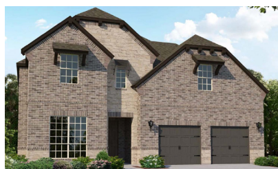
4471 Durst Lane Available May 2024

4 Bed | 4.5 Bath | 2 Story $920,250 | Sq Ft: 3,697