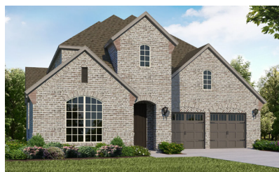
4580 Durst Lane Available June 2024

4 Bed | 4.5 Bath | 2 Story $920,250 | Sq Ft: 3,697