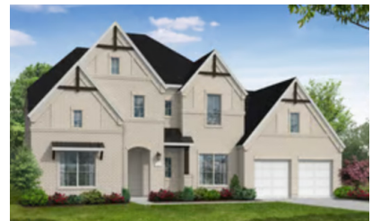
990 Verdin Street Available June 2024

3 Bed | 3.5 Bath | 2 Story $750,624 | Sq Ft: 2,824