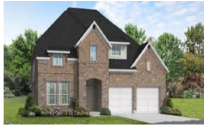
4200 Gambel Road Available July 2024

4 Bed | 4.5 Bath | 2 Story $797,280 | Sq Ft: 3,287