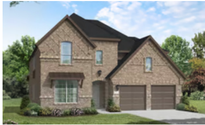
4180 Gambel Road Available July 2024

4 Bed | 4.5 Bath | 2 Story $797,280 | Sq Ft: 3,287