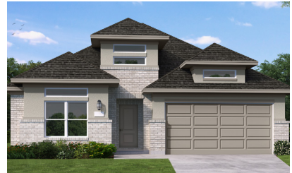
4211 Gambel Road Available Aug 2024

4 Bed | 3.5 Bath | 2 Story $811,414 | Sq Ft: 3,259