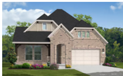
4210 Gambel Road Available June 2024

3 Bed | 4.5 Bath | 2 Story $855,708 | Sq Ft: 3,488