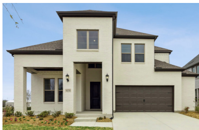
4250 Kinglet Court Available Now 4 Bed | 4.5 Bath | 2 Story $885,801 | Sq Ft: 3,423