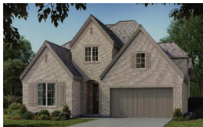
970 Adair Road Available July 2024

5 Bed | 4 Bath | 2 Story $930,000 | Sq Ft: 3,559