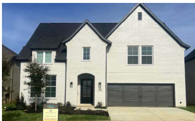
3860 Dixie Lane Available Now

4270 Old Rosebud Lane, Prosper, TX 75078