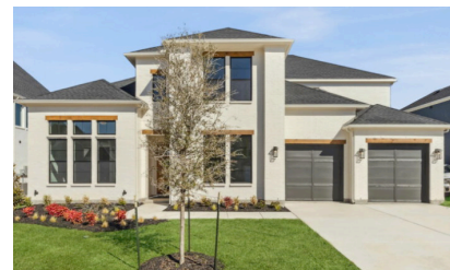
4650 Guthrie Street Available Now 4 Bed | 4.5 Bath | 2 Story $1,100,000 | Sq Ft: 3,893