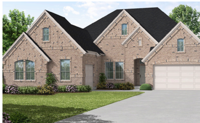
4050 Lavina Lane Available Sept 2024

4 Bed | 3 Bath | 1 Story $731,199 | Sq Ft: 2,541