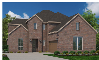
4671 Mayfield Drive Available June 2024

4 Bed | 4.5 Bath | 2 Story $944,330 | Sq Ft: 3,312