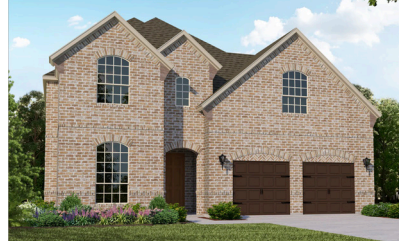
4630 Mayfield Drive Available July 2024

4 Bed | 4.5 Bath | 2 Story $929,430 | Sq Ft: 3,517