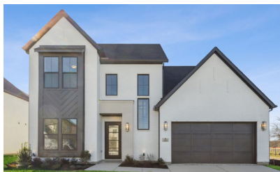
4251 Kinglet Court Available Now 4 Bed | 4.5 Bath | 2 Story $926,137 | Sq Ft: 3,574

4300 Old Rosebud Lane, Prosper, TX 75078