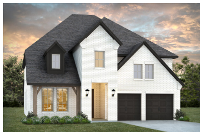
4090 Kestrel Street Available July 2024 5 Bed | 5.5 Bath | 2 Story $889,362 | Sq Ft: 3,588